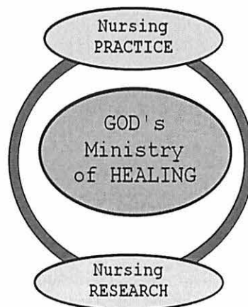
Figure 2. Nursing in the context of the Bible

both the client and the nurse. Their faith in Him will be strengthened. By such act, as Christian nurses, they will be inspired continually and will not be weary in their work, in their profession. In effect, it would increase their confidence that they are serving a living God, spiritually alive beside them, protecting them from committing errors so that the patients' life will always be safe. That they may constantly see God's desire for their patients and for themselves to have a satisfying life promoting experience. White (1943:51) indicated that it is only through the grace of Christ that the work of restoration, physical, mental, and spiritual, can be accomplished. Figure 2 shows nursing in the context of the Bible.