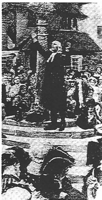
John Wesley in action

thought. It is a theological tradition that makes sense in the contemporary world on several counts. The breadth of its sources—Scripture, tradition, reason, and experience—provides a broad basis upon which to respond to the challenges introduced by the secular world. Revelation and reason provide scope for both the divine source and the human quest for understanding. Wesley's combination of reason and experience (intuition) provides a way of thinking about tensions be-